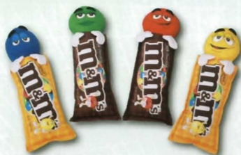
M & M Guys Sleeping Bags

Five 36" Plush and Five 12" Plush Characters (10 Total Drawings Per School)