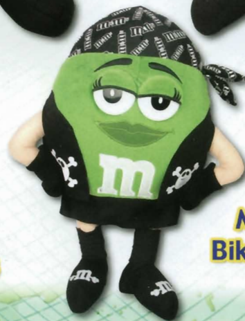
M & M Biker Guys

Provided Exclusively for Mountain Empire Promotions 1-800-940-9032