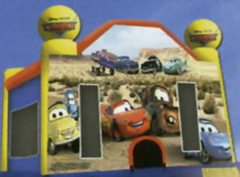
Cars Bounce House