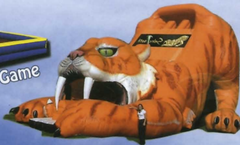
Sabre Tooth Slide