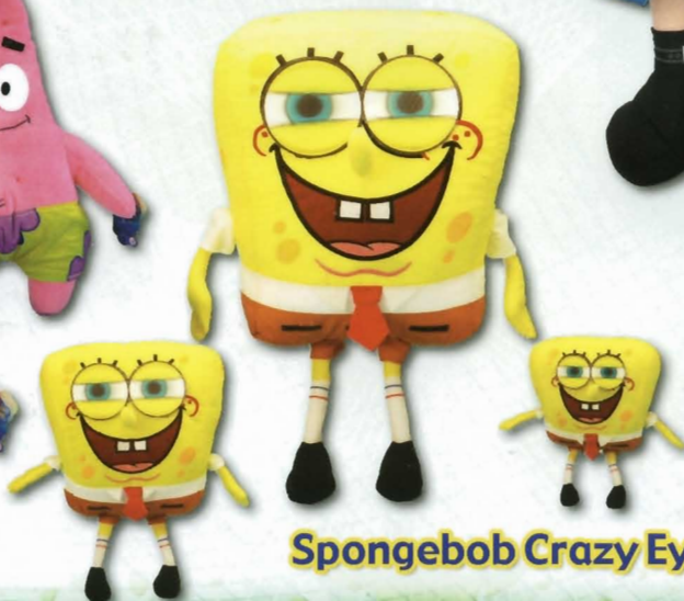
Spongebob Crazy Eyes