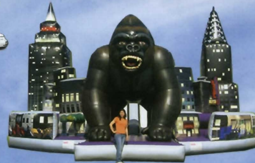
King Kong Obstacle Course