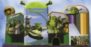
Shrek Bounce House