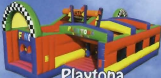
Playtana Obstacle Course