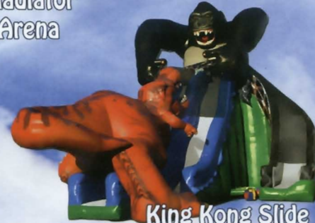
King Kong Slide