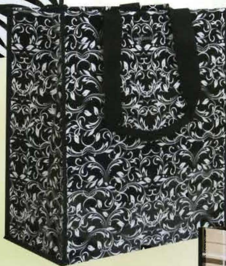
1585 WHITE PROVENCE