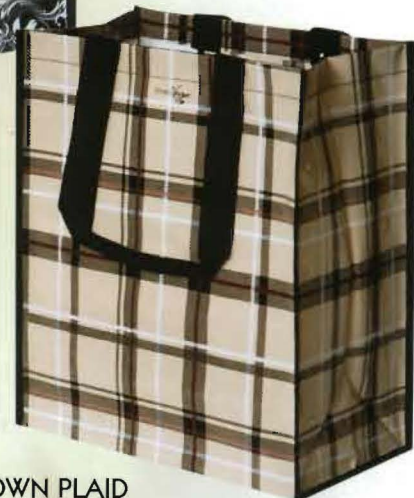
1605 UPTOWN PLAID