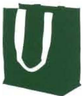
All purpose Multi-Totes