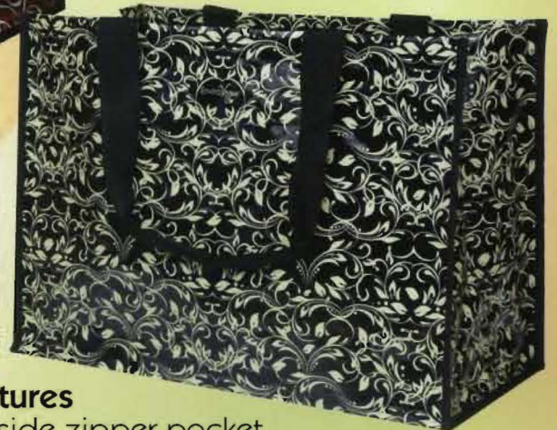
1565 TAN PROVENCE