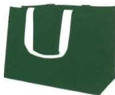
Pack-it-all Power Shoppers